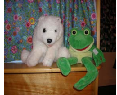
Bella & Freddie