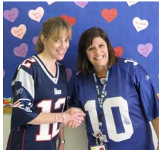
A friend loves at all times. Proverbs 17:17